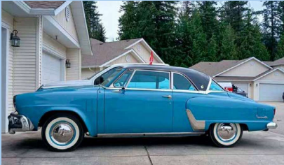
1952 Studebaker Champion Starliner Hardtop