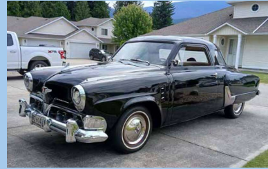
1952 Studebaker Champion Deluxe Starlight Coupe