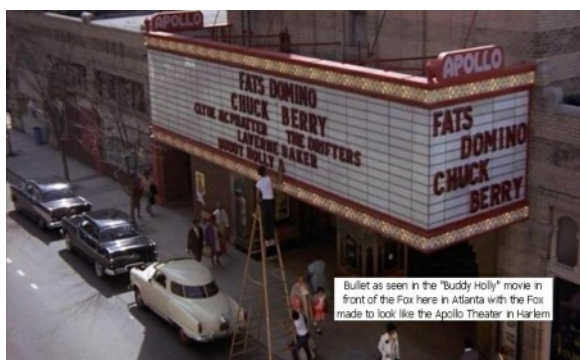
Bullet at the "Apollo"