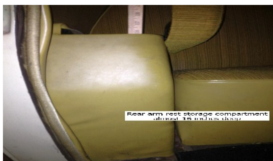
1951 Starlight Coupe Rear Armrest Storage