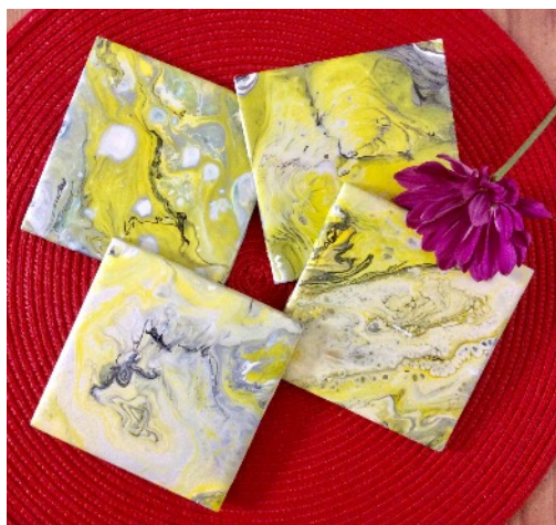
Poured acrylics on ceramic tiles by Guadalupe Taylor