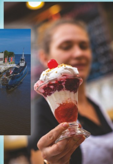
Two Rivers, Wis. Home of the Ice Cream Sundae

Enjoy the hospitality of our friendly community.