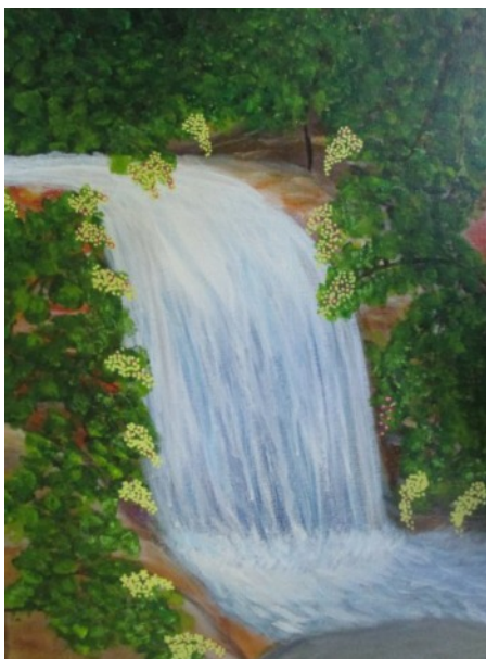
Acrylic painting on canvas by Guadalupe Taylor