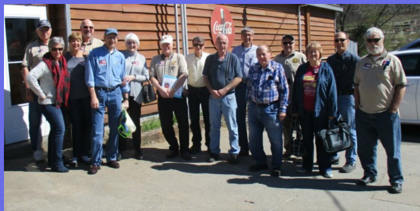
Attendees lined up outside waiting to get in.