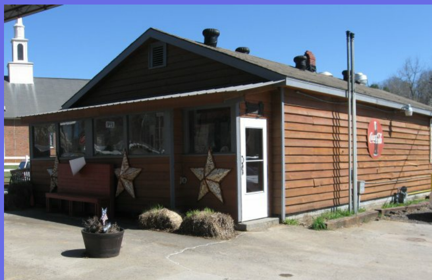
The meeting was held at the Keithsburg Cafe