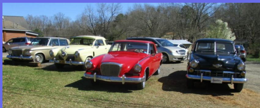
It was great to see Studebakers in the parking lot.