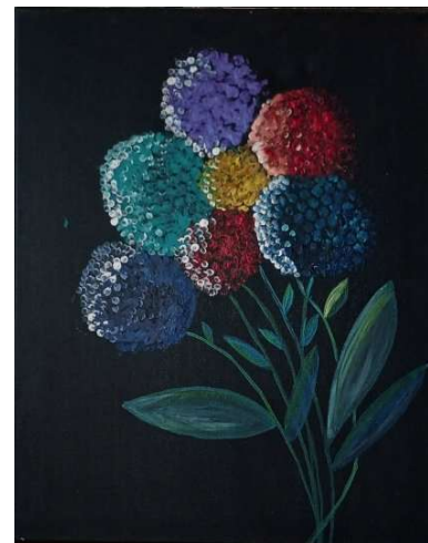
Acrylic paint on canvas by Guadalupe Taylor