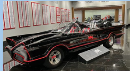
From the Savoy Museum