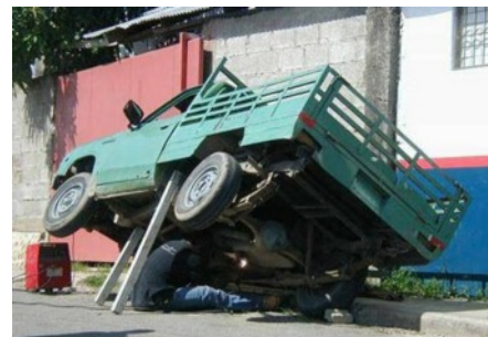
Safety first - always!