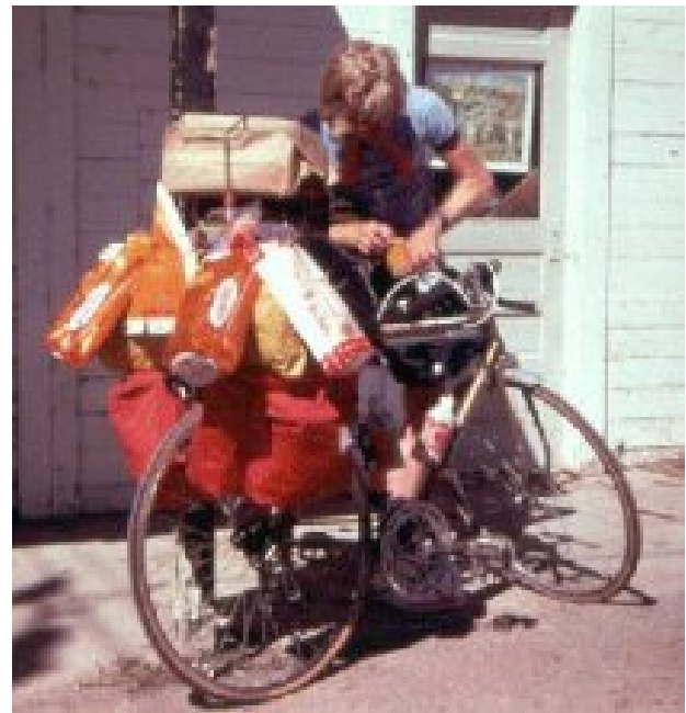
This photo dates back to 1977 when one of our SDC members was picking up groceries on his "vehicle." So who do you think it is?