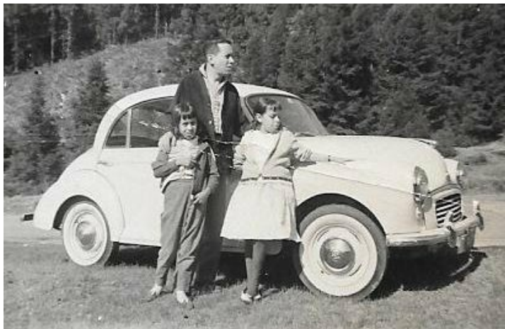
Can you identify the car? Can you name the gal on the left, who is a member of our North Georgia SDC?