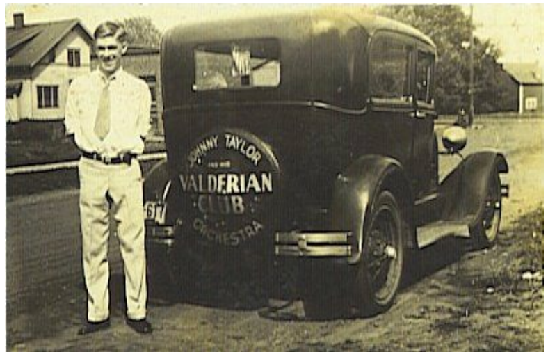
Okay, maybe this is cheating a bit, but this gentleman is not a member of the SDC. However, he is the father of one of the members. Any guesses?