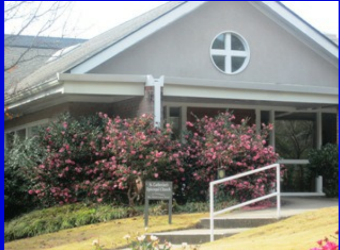
The December meeting/party was held at St. Catherine's Episcopal Church in Marietta