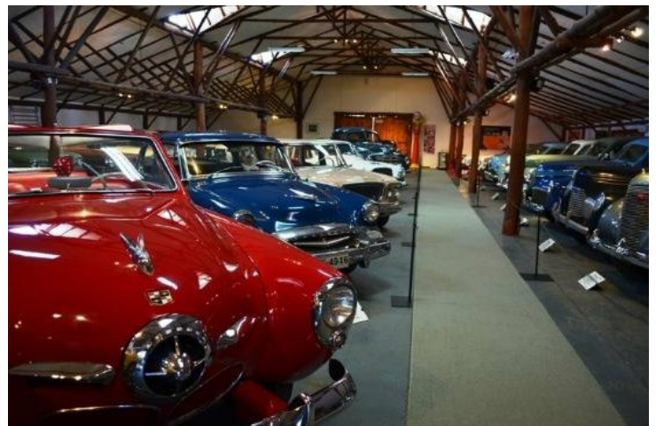
Auto Museum Moncopulli, Osorno, Chile