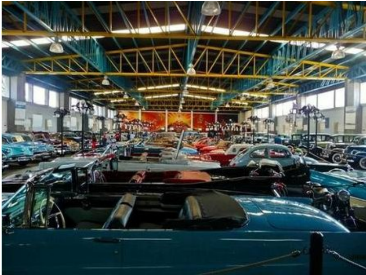
Museo del Automovil, Mexico City, Mexico