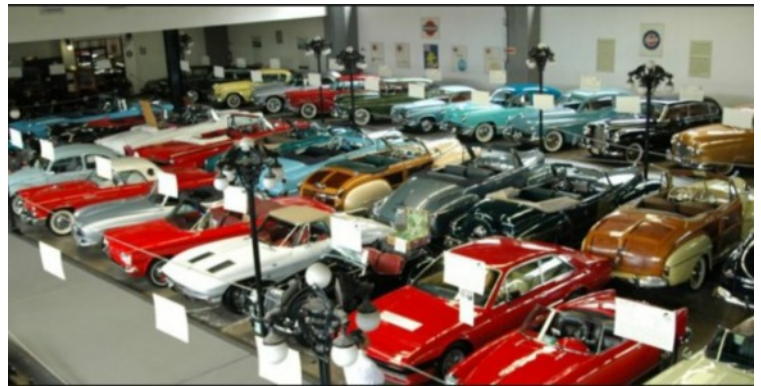
Museo del Automovil, Puebla, Mexico