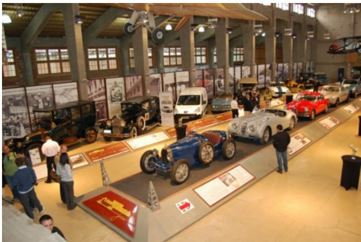
Museo de Autos y del Transporte, Monterrey, Mexico