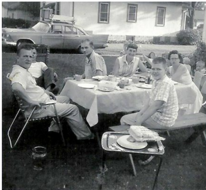
The fellow in the middle is one of our SDC members. Nice '57 Plymouth in the background, eh? Love those fins!