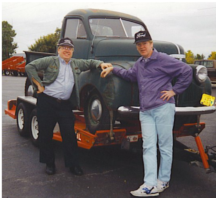
Any familiar face here? (Might be too easy)

We need your photo here. How about submitting one for next month?