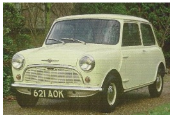
Austin Mini, Great Britain