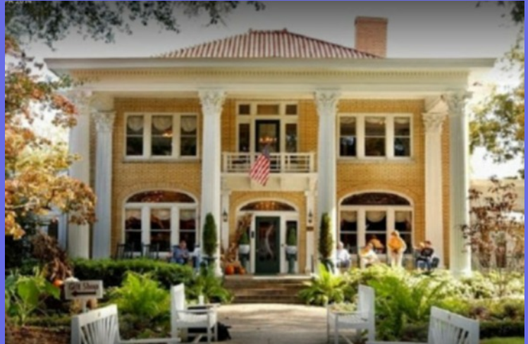
The Blue Willow Inn