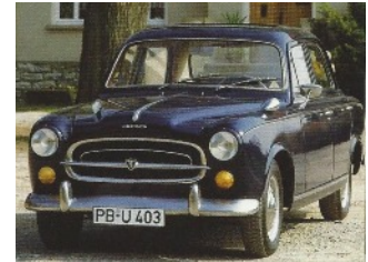
Peugeot 403, France