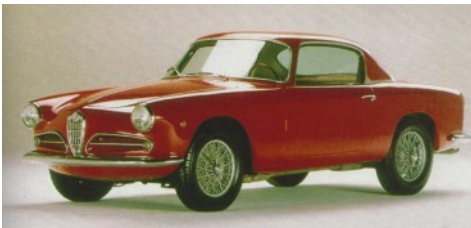
Alfa Romeo, Italy

Identify the marque and country of each automobile shown below: