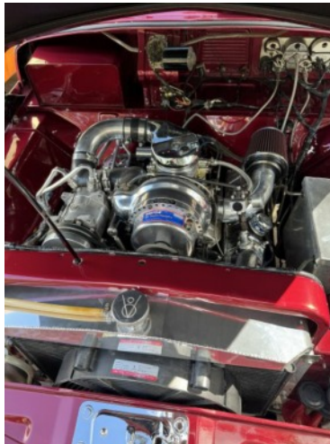
Engines seen at the Florida State Meet