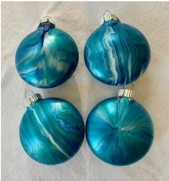
Acrylic paint transfer technique over clear plastic ornaments by Guadalupe Taylor