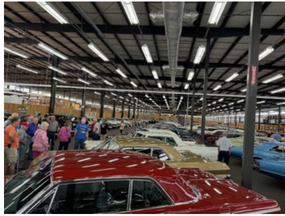
From the National Parts Depot collection