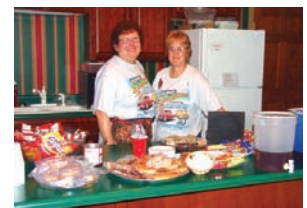
Hospitality room at the hotel