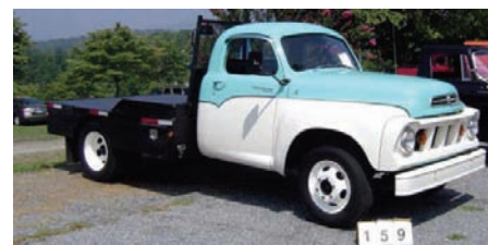
Division VIII, Art Copeland