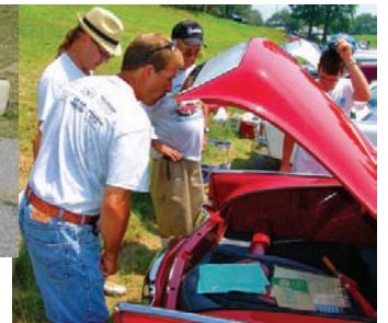
Judges at work