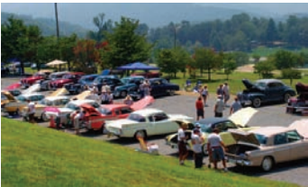
Beautiful setting and cars