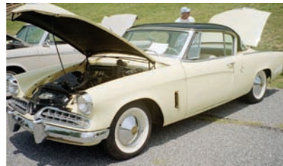
Open for inspection